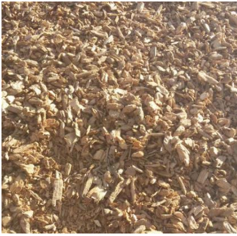
Fresh Wood Chips at PCL

Central Coast Landscape Products can load and deliver for an additional fee. Discounts are available for orders over 40 yards.