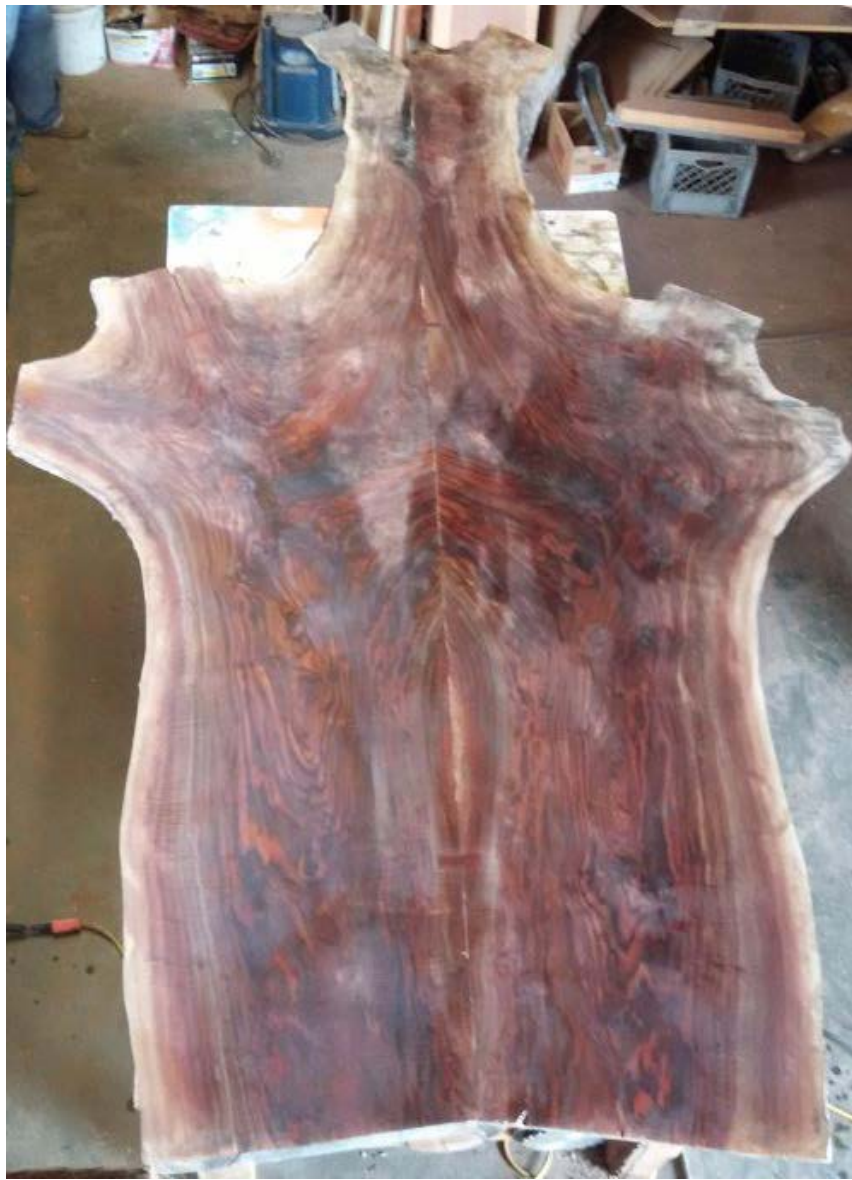
Custom Planed 4'x10' Book-matched Walnut Slab.