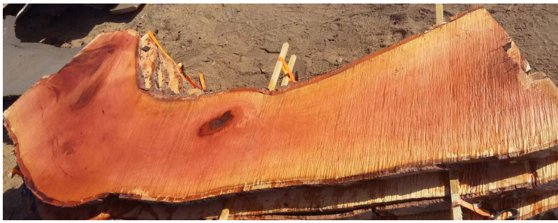
Sycamore with Sweeping Arch