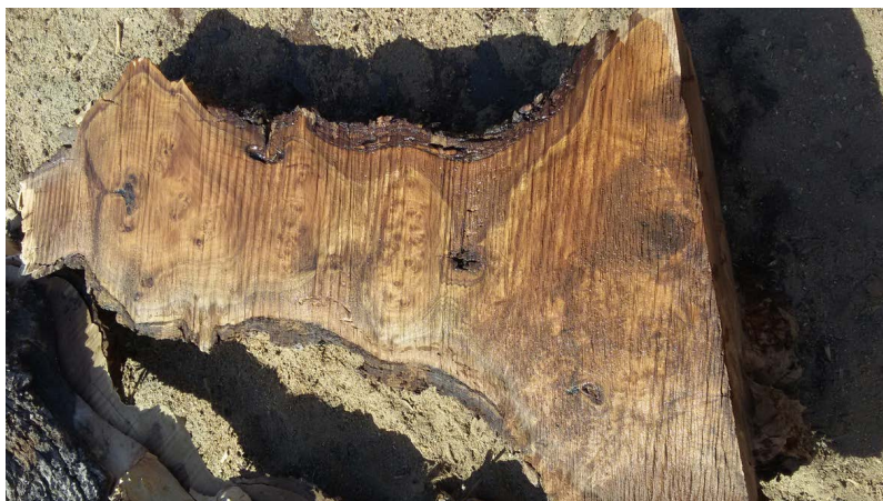
Gorgeous Walnut Slab with Pin Burl

Come by our shop at 445 Prado Road T#3 during normal business hours and have a look at our vast slab and log inventory to get some great ideas for your next project!